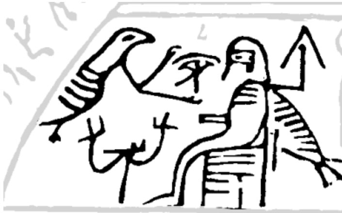
7. Represents God sitting upon his throne, revealing through the heavens the grand Key-words of the Priesthood; as, also, the sign of the Holy Ghost unto Abraham, in the form of a dove.

The one who receives that token – that new name – that new and quickened holiness and pure knowledge from God, is YOU.